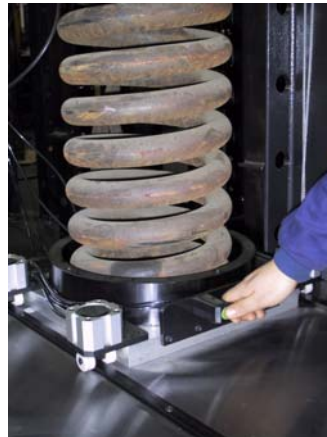
Special press to test accurately the strength of the springs of a train suspension